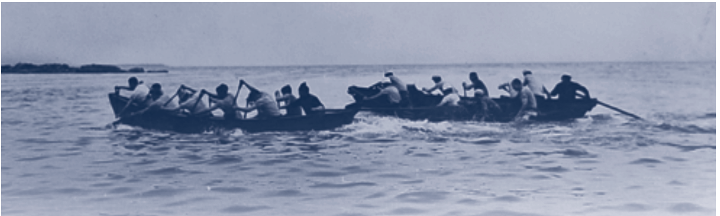
■ Boat race between UNALGA and BEAR crew.