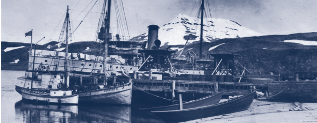
■ UNALGA, in background, anchored at Unalaska, summer 1919

Alaska's population in 1919 was largely native Aleutians, with seasonal fish cannery employees. Most of the ethnic Russians were gone, but the Yup'iks and Aleutians followed the Russian orthodox faith. Coastal towns were the first to be afflicted with the first wave of influenza in 1918, when likely ships carrying infected passengers and crew arrived. and it quickly spread to the more isolated villages in southeast Alaska. Relief expeditions, through the Bureau of Education, were sent to remote areas. At that time, the Bureau of Education was a government agency that provided teachers and medical personnel in Alaska. Teachers from the Bureau of Education initially provided limited health care services, but doctors and nurses were later privately hired by fish canneries in the area. Doctors were also often recruited in Alaska as federal representatives, first as commissioners of the Bureau of Education, and later as representatives of the Public Health Service. However, while they did provide some assistance, they could not contain or curb the influenza. The reason lay in the fact that most of the remote Alaskan villages were accessible only by dog sled. For instance, people in Dillingham, Alaska did not know that World War I had ended until a little over a month after the armistice was signed, and it took the messenger twelve days by dog sled to deliver that news. 2