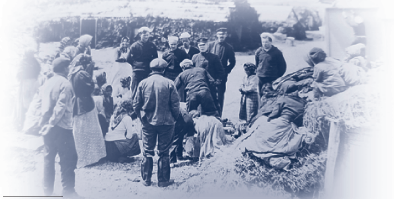
■ UNALGA crew with Native villagers.