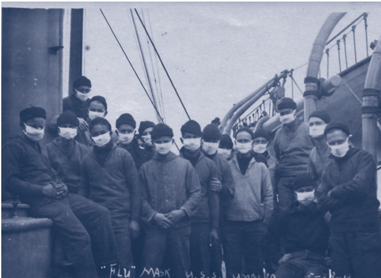
■ UNALGA crew wearing masks.